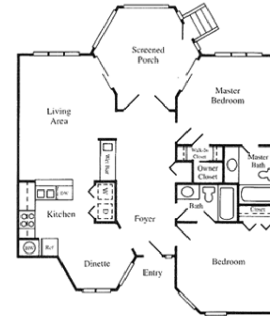
2 Bedroom/2 Bath