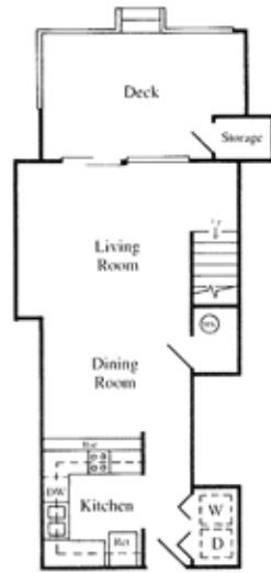
2 Bedroom/2 Bath Townhouse Type