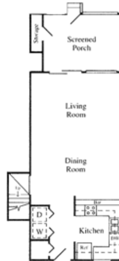
1 Bedroom/1 Bath Townhouse Type