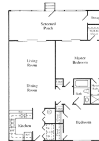
2 Bedroom/2 Bath Flat