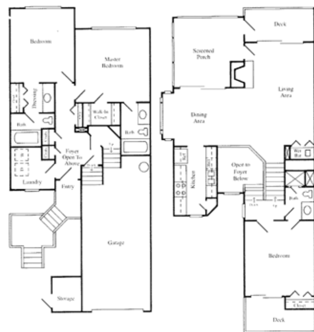
3 Bedroom Exterior Approx. 1675 Sq. Ft. ±